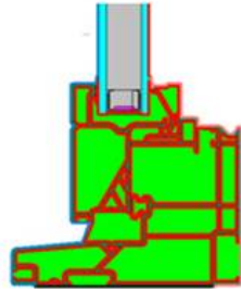
3/4" IGU Double Glazed

* NFRC standard casement window size is 23.622" W x 59.055" H.